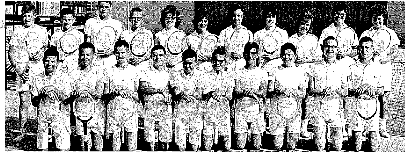
8th Grade Tennis