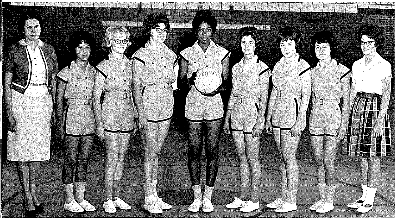
"A" Team Volleyball