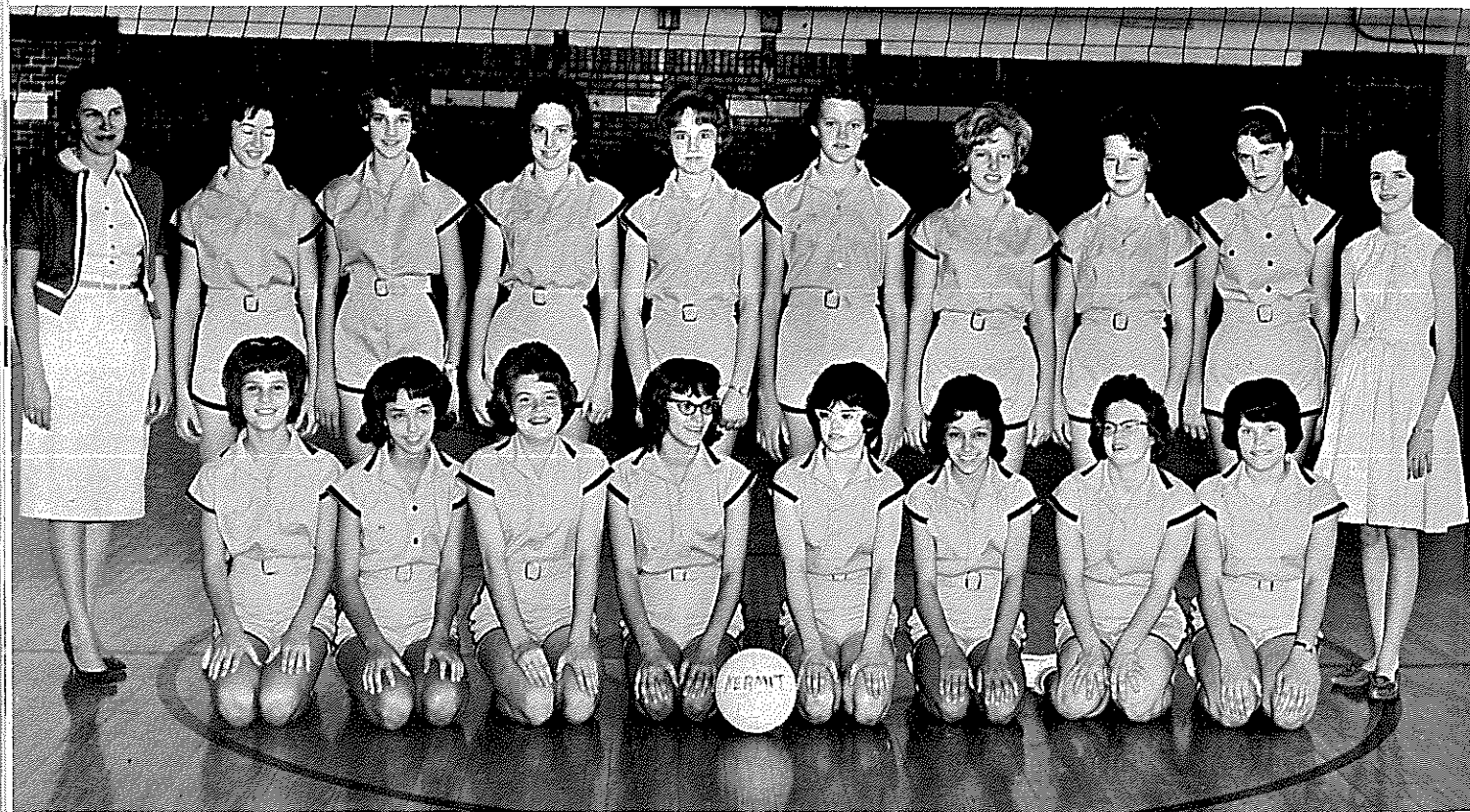
"B" Team Volleyball