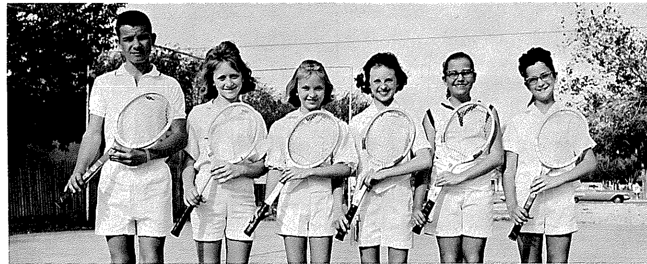
6th Grade Tennis